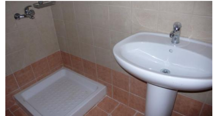
Bedroom & bathroom