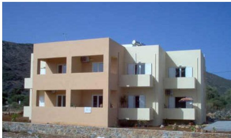
View of the apartment building

The sandy beach resorts of Kalives and Almerida are just a short drive away.