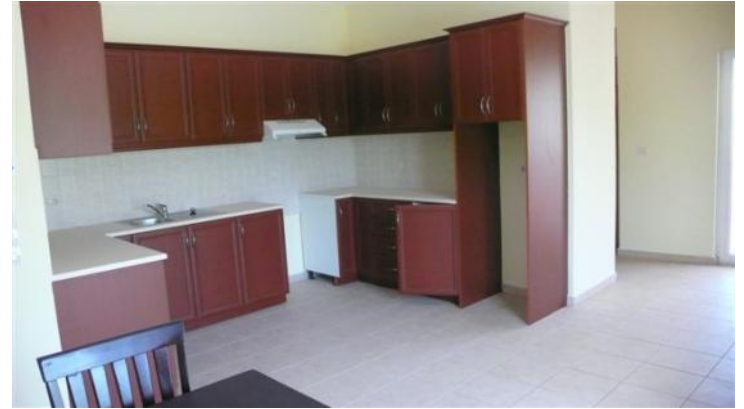
Kitchen & Dining areas