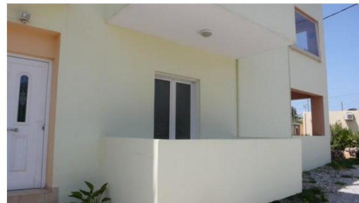
View of the apartment

Your Piece Of Paradise... Your Peace Of Mind