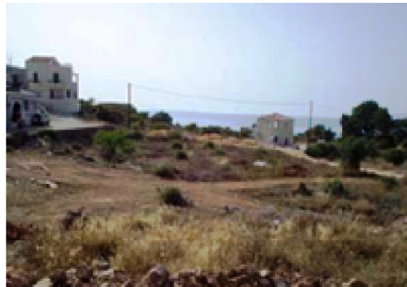
View from the plot