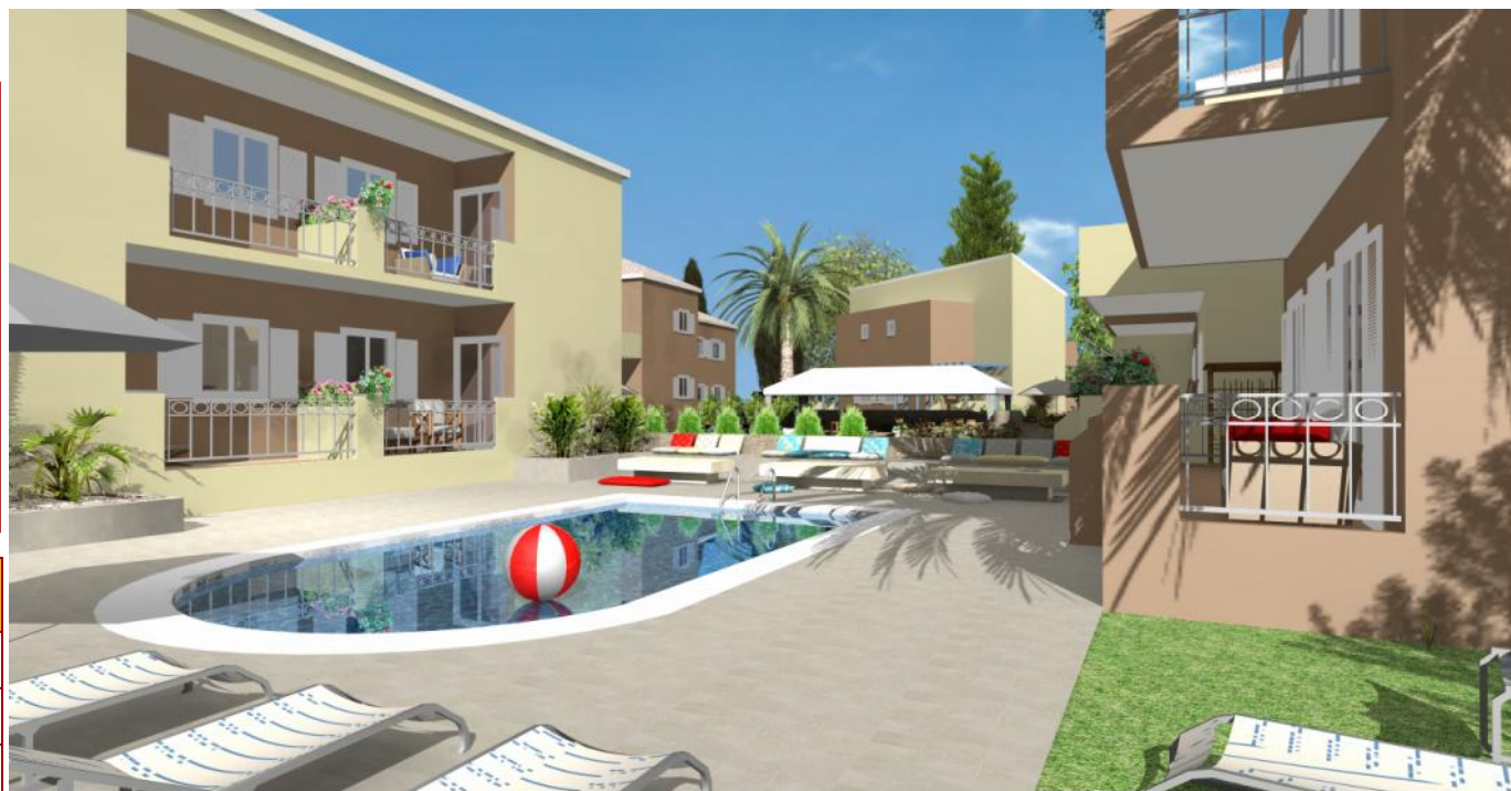
Architect's 3D impression

Your Piece Of Paradise... Your Peace Of Mind