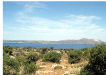
Views of the local area