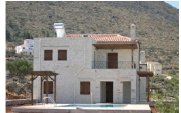
Example of a similar stone Villa