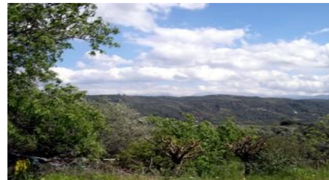
Views from Gavalomouri