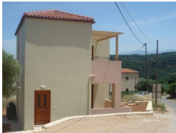
Example of completed villa on the plot

Gavalomouri is a pretty village with a church, taverna & kafeneon. Nearby Voukolies has all the amenities needed for day to day living & the beach at Tavronitis is just a few minutes drive away.