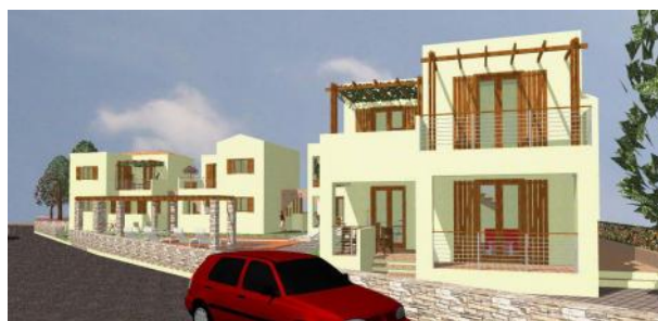
Architect's 3D impression