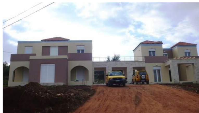
Views of the completed villas

These villas are a perfect investment for both holiday and year-round living.