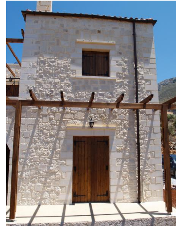
Example of a similar style stone Villa