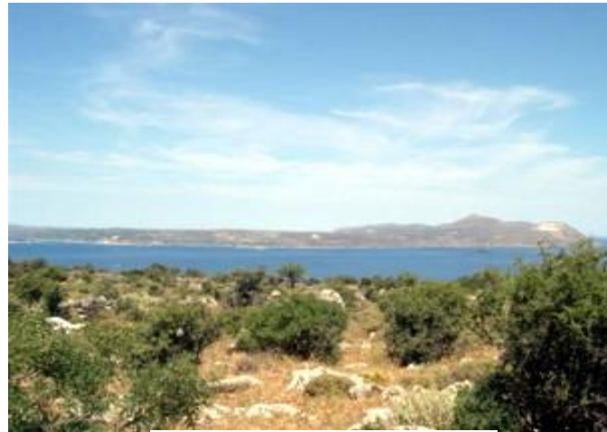
View of the area

Kokkino Chorio is just a few minutes from the village of Plaka and the nearby beach resorts of Almerida and Kalives. Chania airport can be reached in around 40 minutes.