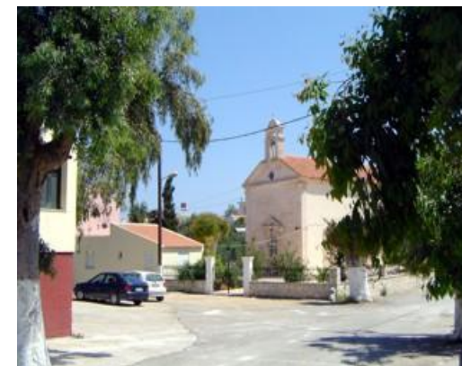
The shops & offices and views of Plaka